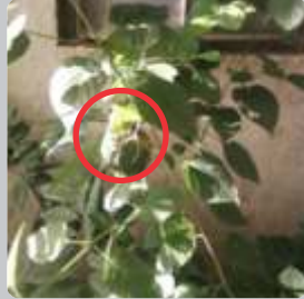
2) Nest built by small bird species on one of the small flower tree