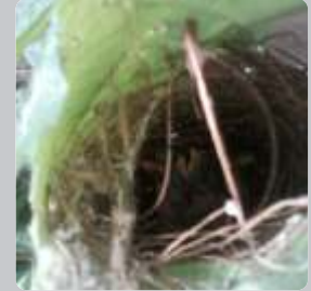
4) Small baby birds resting in next.

"So please grow trees/plants in whatever small area it may be, who knows it will form as a safe shelter to bird species and support ecosystem in its own capacity. By doing this you will really contribute to sustain the ecosystem on this earth."