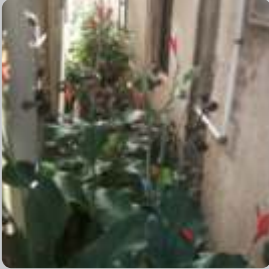
1) Flower trees grown in space between two houses

I could realize the power of nature. No matter how small it may be, in whatever form it may be, wherever it may be, every part of nature always support living beings/creatures on the earth. For us it may be small tree or shrub but for that small bird species it was a safe shelter where they were growing their next generation."