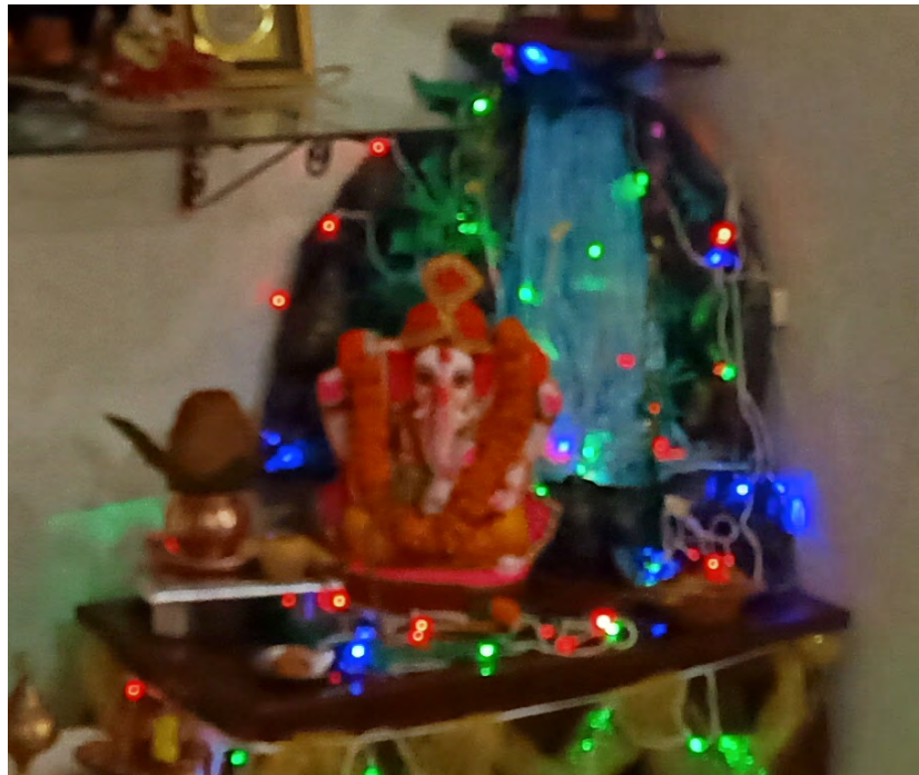
Ajit Bilolikar Industrial Energy Ltd. (Site) Power House # 6