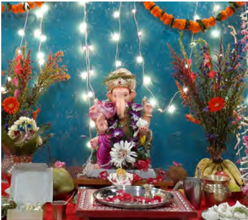
Satya Naidu - Carnac