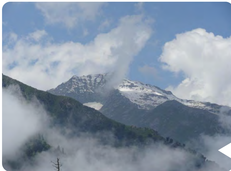
Pragnesh Satapara, CGPL