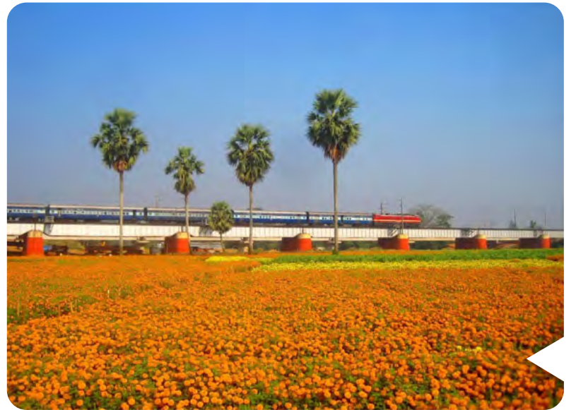
Piyush Singh, Tata Power Solar