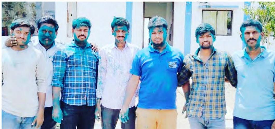
WREL AP 30MW, Kadapa , Andhra Pradesh