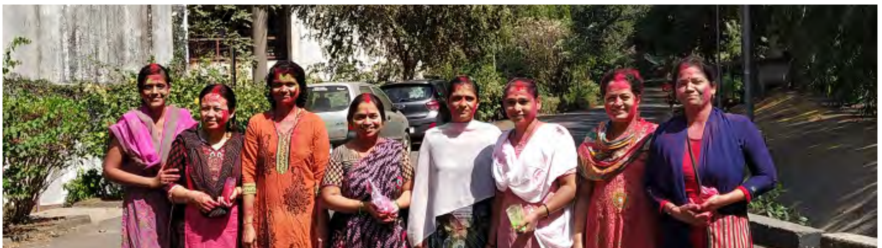
Trombay colony residents celebrated ' Dry Holi '.