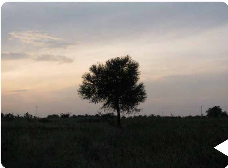
Prakash JS, Tata Power Solar