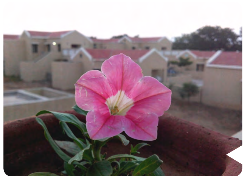
Tushar Tripathi, CGPL