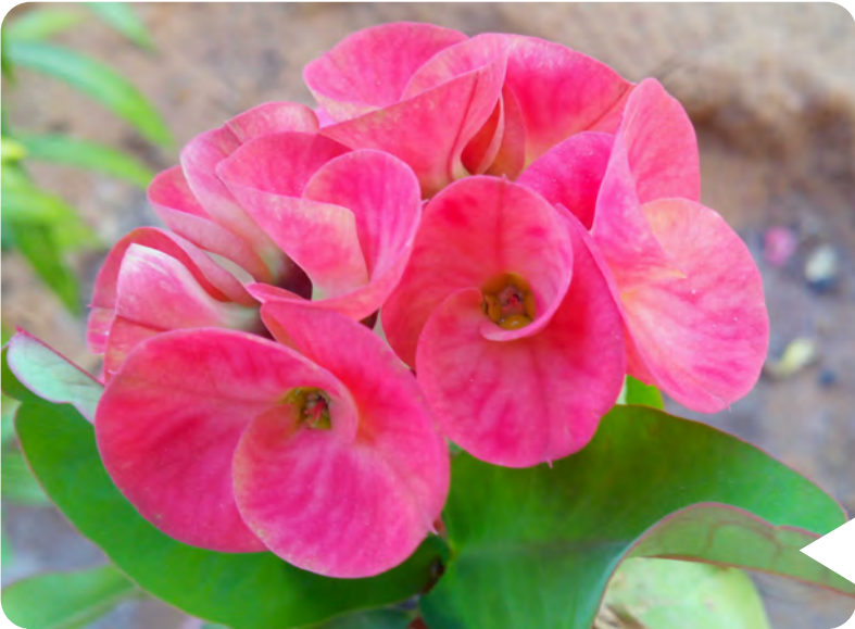
Tushar Tripathi, CGPL