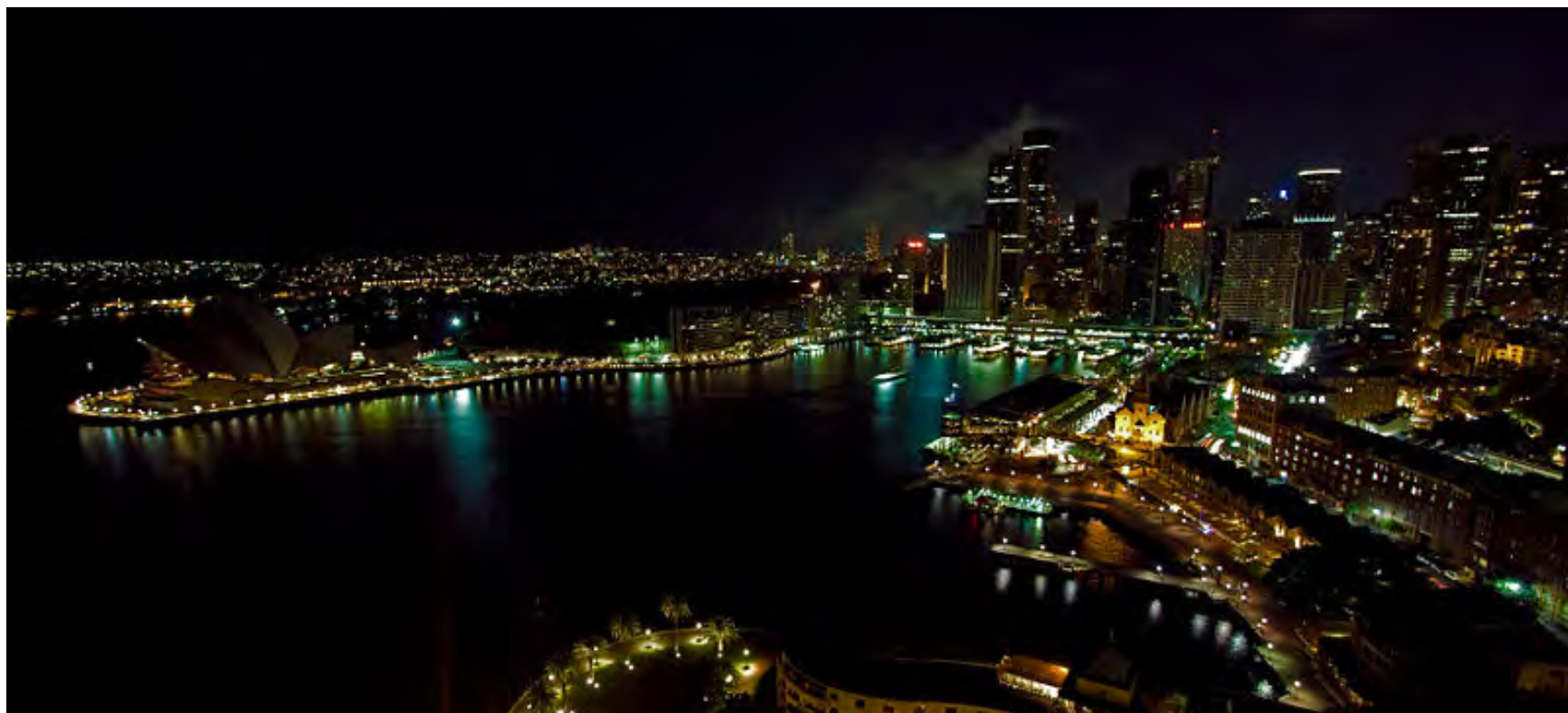
Overview of Sydney during Earth Hour 2008

March 19, 2016 is Earth Hour day! What began off as a lights-off event in Sydney, Australia in 2007, has since grown to engage over 172 countries and territories globally. On the occasion this year, join Greenolution in its attempt to help reverse the impact of climate change. Participate in Greenolution's 'One Hour for Earth' campaign! To do so, turn off all unwanted electrical appliances and lights between 8:30 and 9:30pm on March 19, 2016 and send photos/videos of how you spent 'One Hour for Earth'! Best 5 entries stand a chance to exciting prizes and have their photos and videos played in the March episode of The Green Zine!