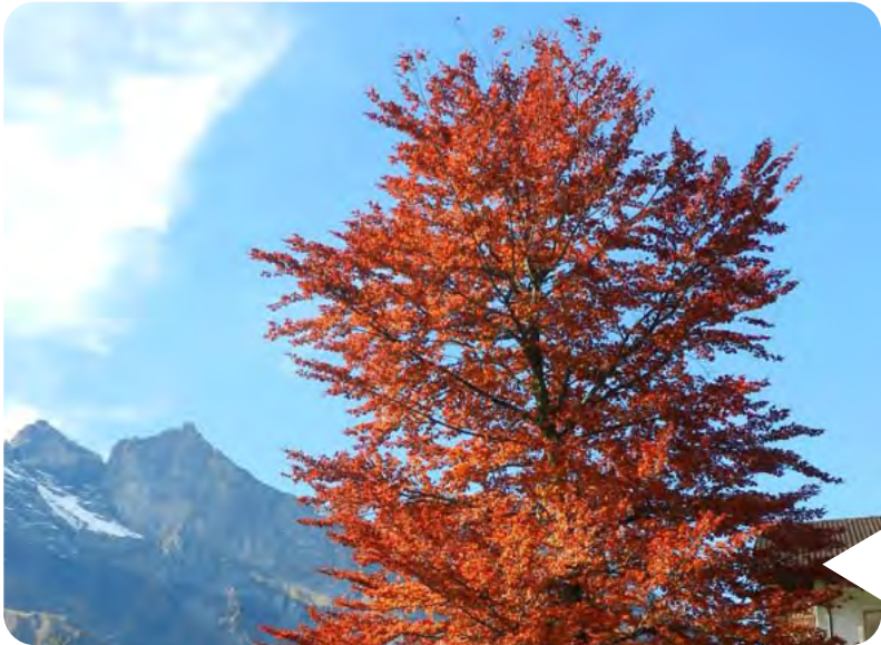
Vidhi Tyagi, Tata Power Solar