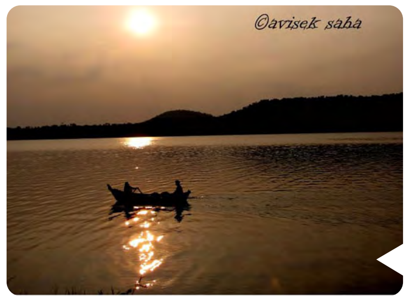
Avisek Saha, CGPL