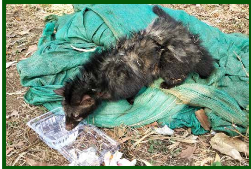
Green heroes: Laxman Kate and Satish Sagar

Asian palm civets eat berries and pulpy fruits as a major food source and thus help to maintain tropical forest ecosystems via seed dispersal.